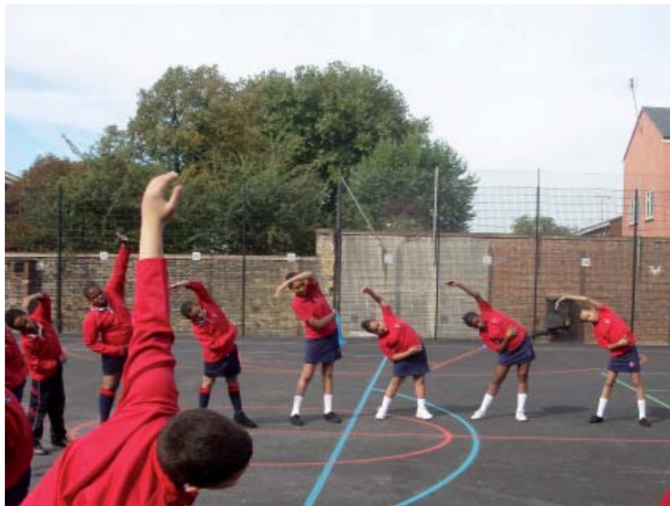
Students warm up in a PE lesson