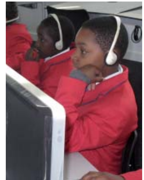
After school classes are already having an impact on literacy

Friday December 18th School closes at 3.40pm for 2 week holiday.